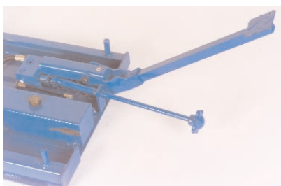
Removable & storable operator's foot pedal and lowering control on basic models.